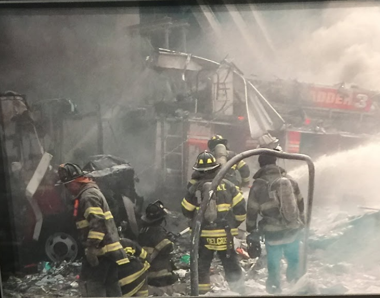
Ladder Company 3 truck, September 11, 2001