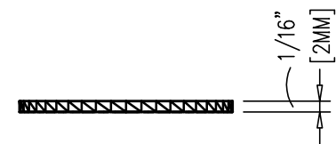
FRONT VIEW SCALE: 1:1